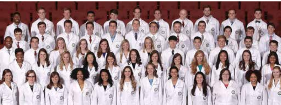
UAB Class of 2020